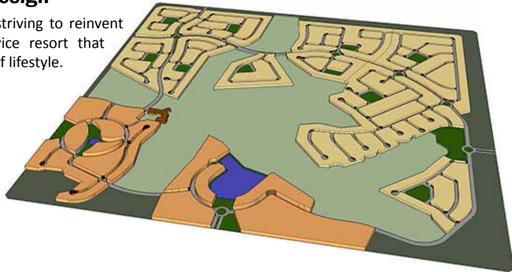
Desert Dunes 3D Concept Plan

A desert community striving to reinvent itself with a full-service resort that expands its historic golf lifestyle.