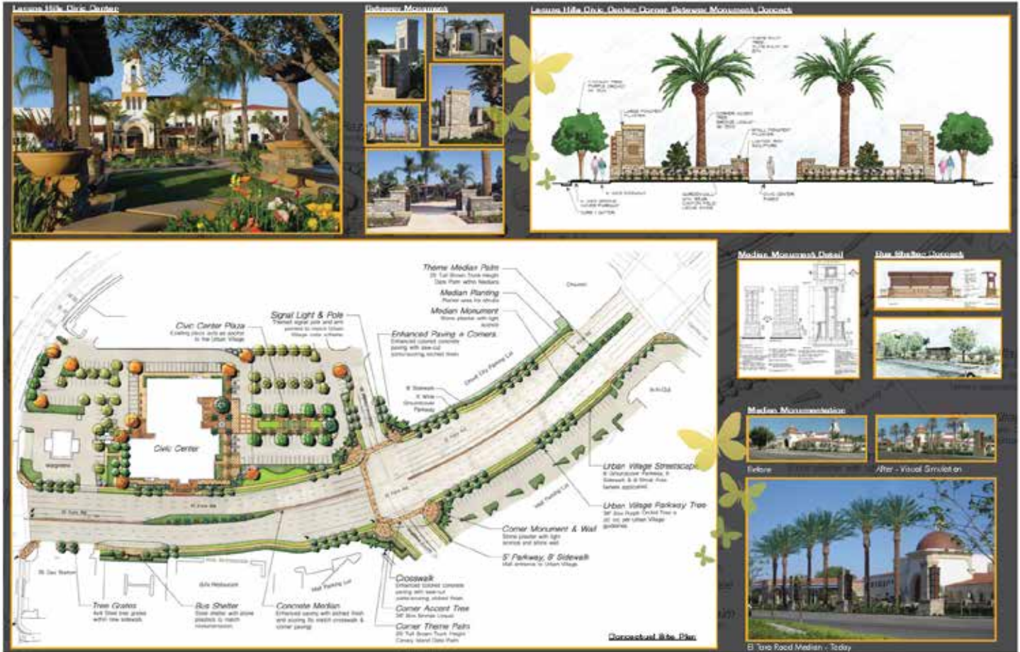
Laguna Hills Civic Center and Urban Village Laguna Hills, California

FORMA assisted the City in its renaissance of its commercial core by designing dramatic hardscape elements that make a statement. This particular area is home to the refurbished Laguna Hills Civic Center in which the landscape setting was designed and implemented by FORMA, the Laguna Hills Mall, and a number of area restaurants and retail businesses.