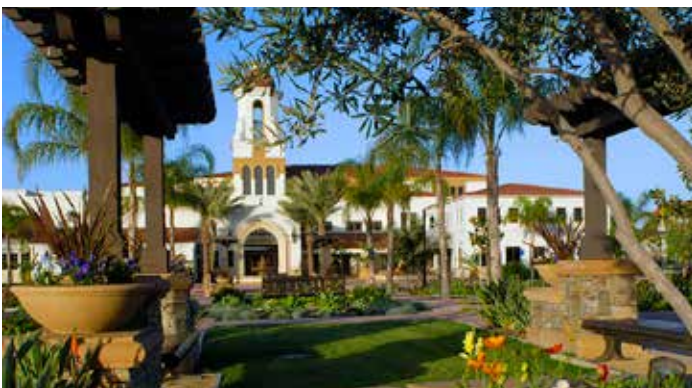
Seating and shade trellises at the Laguna Hills Civic Center Forecourt