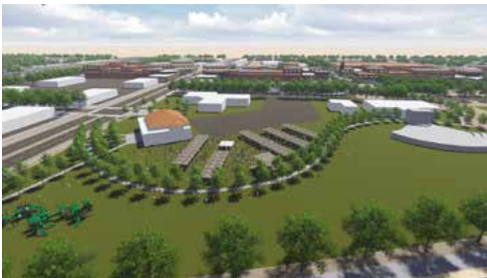
Civic Center - Town Hall and Farmer's Market