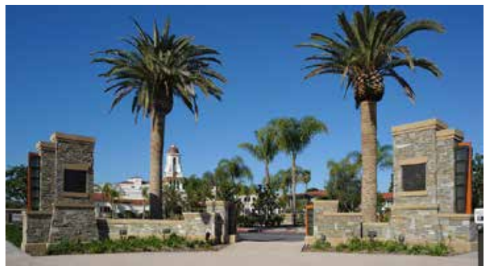
Majestic Phoenix dactylifera flank the stacked stone gateway monuments.